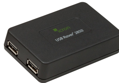
Remote Extender (REX)