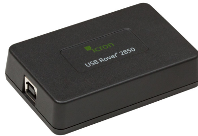
Local Extender (LEX)

The USB Rover® 2850 extends USB connections beyond the desktop up to 40 meters (85 meters achievable with some Low-Speed HID devices such as keyboards and mice).