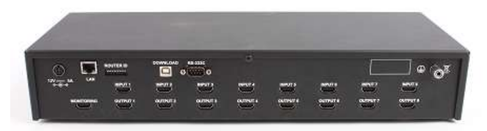
<Rear Panel of OHM-88>