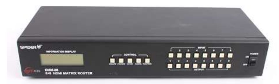
<Front Panel of OHM-88>