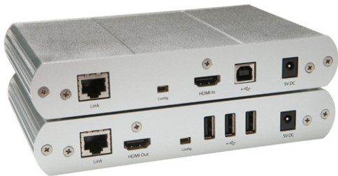
Rear view of LEX (top) and REX (bottom)