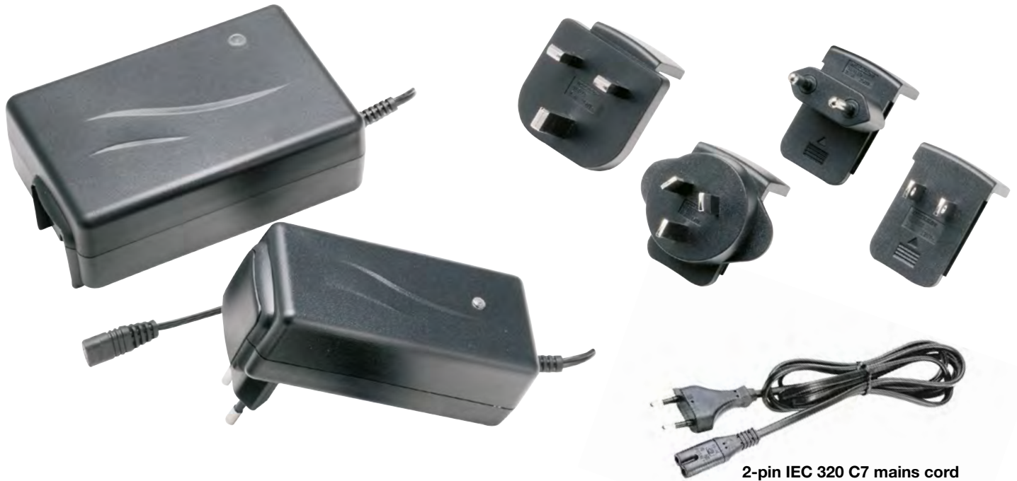
2-pin IEC 320 C7 mains cord 1800 mm EU part no. 131306 UK part no. 131148, US part no. 131147, AU part no. 013108

For 2241Li only: Exchangeable AC plug models